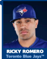
RICKY ROMERO Toronto Blue Jays™

"All I want to do is just go out there and play the best I can possibly play. That's excellence to me."