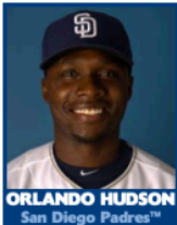
ORLANDO HUDSON San Diego Padres™

"Having charisma, playing hard every day, being a great citizen, and committing to teamwork is me being part of Mr. Jackie Robinson."