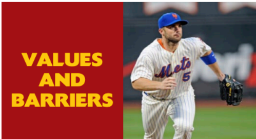
David Wright, New York Mets™