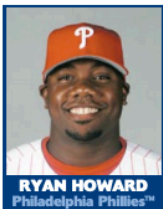
RYAN HOWARD Philadelphia Phillies™

"Being successful demands cultivating internal values that guide the way in which you conduct yourself both on and off the field. Seeing the courage and integrity displayed by Jackie Robinson throughout his life has had a great influence on me."