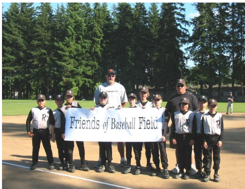
Friends of Baseball Field Rockwood, Oregon

2010 Coach and Volunteer of the Year Nominations Coming to an End! You Still Have Time . . .